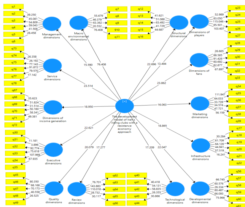
Figure 2. Significant coefficients of t (t-values)