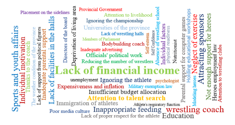
Figure 1- Cloud diagram of research extraction codes

figure number 1, the importance of each of the primary concepts is shown according to its size, and in figure number 2, the ship barriers of Ardabil province are shown according to the importance of each one.